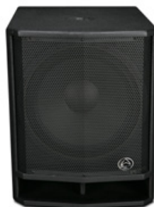
DVP-X18B 18" subwoofer, 4Ω 133dB Max SPL 1000w Programme 2000w Peak