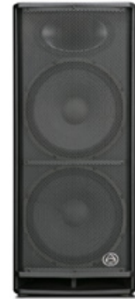
DVP-X215 2-way 2 x 15", 8Ω 135dB Max SPL 1400w Programme 2800w Peak