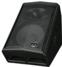
DVP-X12M 2-way 12" monitor, 8Ω 129dB Max SPL 600w Programme 1200w Peak