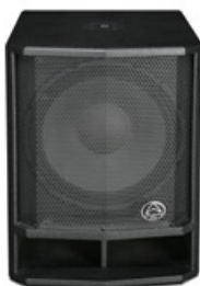
DVP-X15B 15" subwoofer, 4Ω 130dB Max SPL 800w Programme 1600w Peak