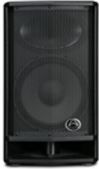
DVP-X12 2-way 12", 8Ω 129dB Max SPL 600w Programme 1200w Peak