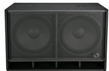
DVP-X218B 2 x 18" subwoofer, 4Ω 138dB Max SPL 2000w Programme 4000w Peak