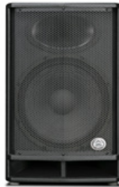
DVP-X15 2-way 15", 8Ω 130dB Max SPL 700w Programme 1400w Peak