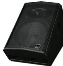
DVP-X15M 2-way 15" monitor, 8Ω 130dB Max SPL 700w Programme 1400w Peak